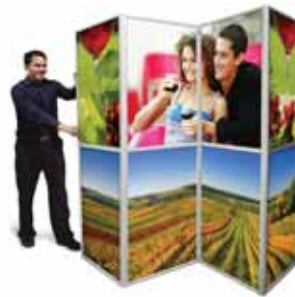
multi-layer 1 7/8" (4.8 cm)