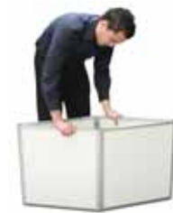
full frame 1 1/4" (3.2 cm)