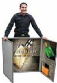
double layer 1 1/4" (3.2 cm)